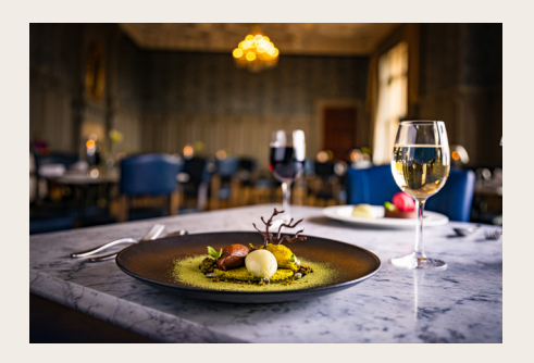
THE TIMES: TOP 100 BRITISH HOTELS